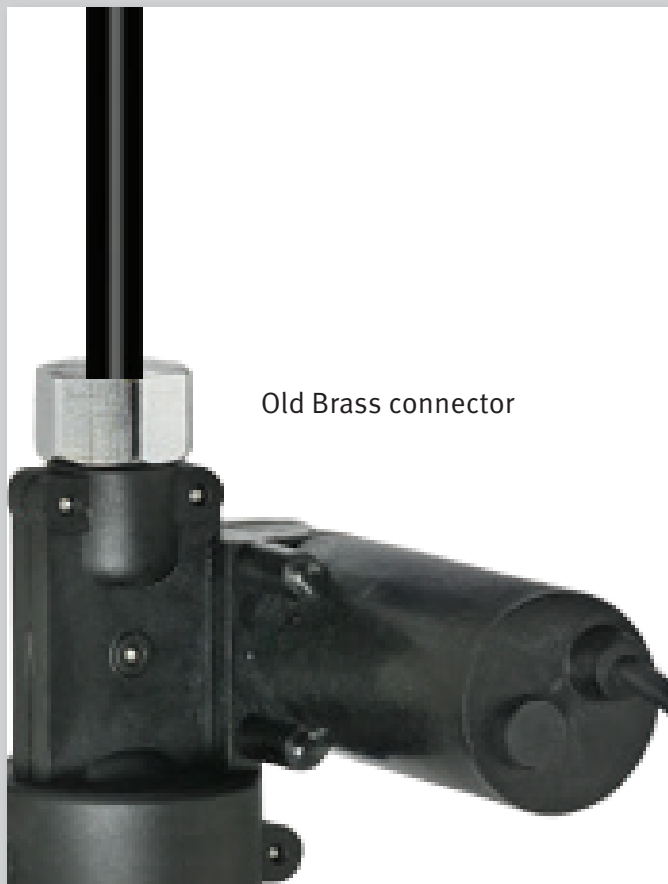
Old Brass connector